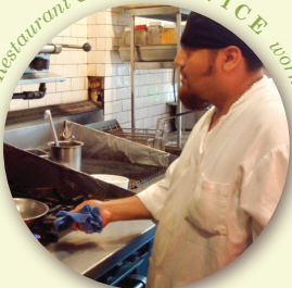
Restaurant & food SERVICE workers