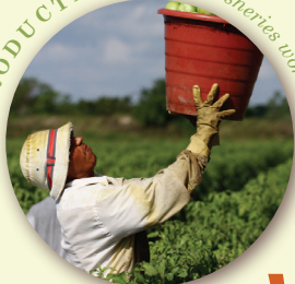
PRODUCTION farm & fisheries workers