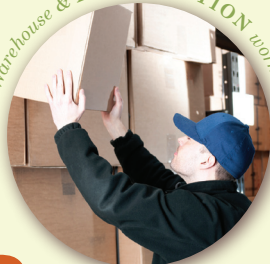
Warehouse & DISTRIBUTION workers